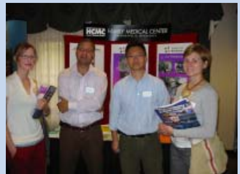
Minnesota medical students visit with representatives from HCMC while at the Residency Recruitment Event.