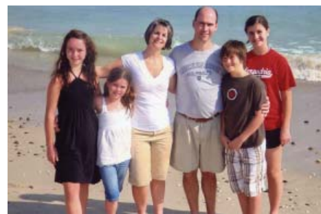
The Lussenhop family on vacation.