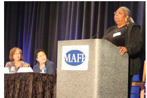
A patient shares her experience with the Chronic Disease Self-Management program during the House of Delegates in April.