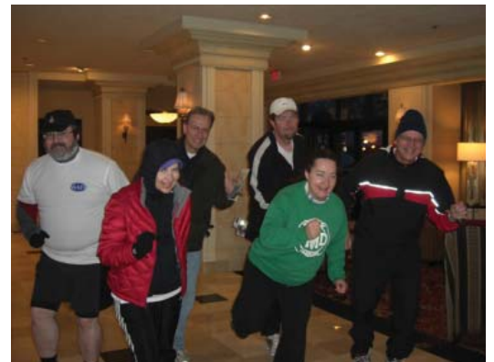
Family doctors participate in an early morning walk/run on Friday, April 15, 2011.

The weather may have been colder than normal and the group smaller than usual, but several brave souls still bundled up to participate in the Family Docs in Motion 3K Run/Walk presented by the MAFP Foundation.