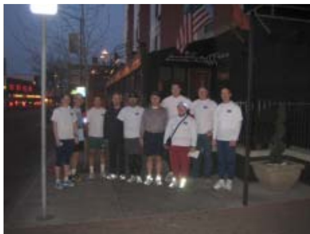
Family physicians gather on a St. Paul street Thursday morning before going on an early morning fitness walk/run.