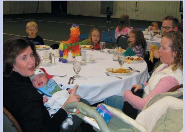
Participants enjoy the Friday Night Family Dinner during the Winter Conference in Alexandria.

The next MAFP Winter Conference has been scheduled for February 5-6, 2010, at The Lodge at Brainerd Lakes.